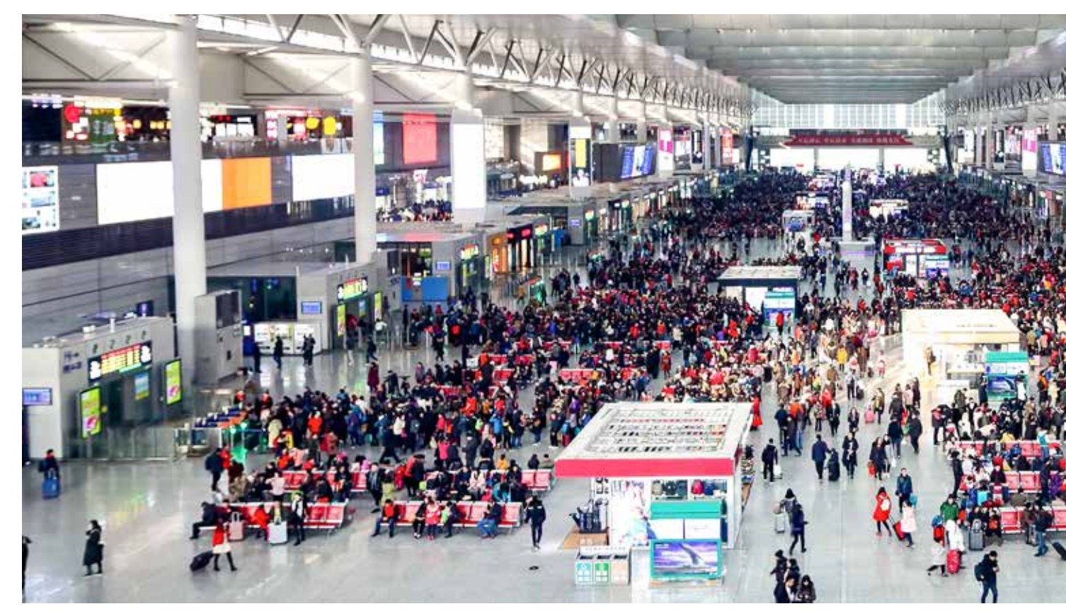
China's high-speed trains do not just top the list of the world's fastest mass-produced trains; the country also has the largest train stations in the world - this picture shows Shanghai's

In the late 1990s, the Chinese Government decided to improve the traffic networks between China's large cities. The distances between these cities are often very long, and the plan called for high-speed trains that could traverse such distances quickly while offering room for many passengers. A high-speed railroad network of about 30,000 kilometers for public transportation is being built and will be completed in 2020. Right from the start in early 2000, SMA Railway was involved in the first high-speed projects. Today, not quite 20 years later, the plan is about to be fully realized. SMA Railway is on the scene once again.