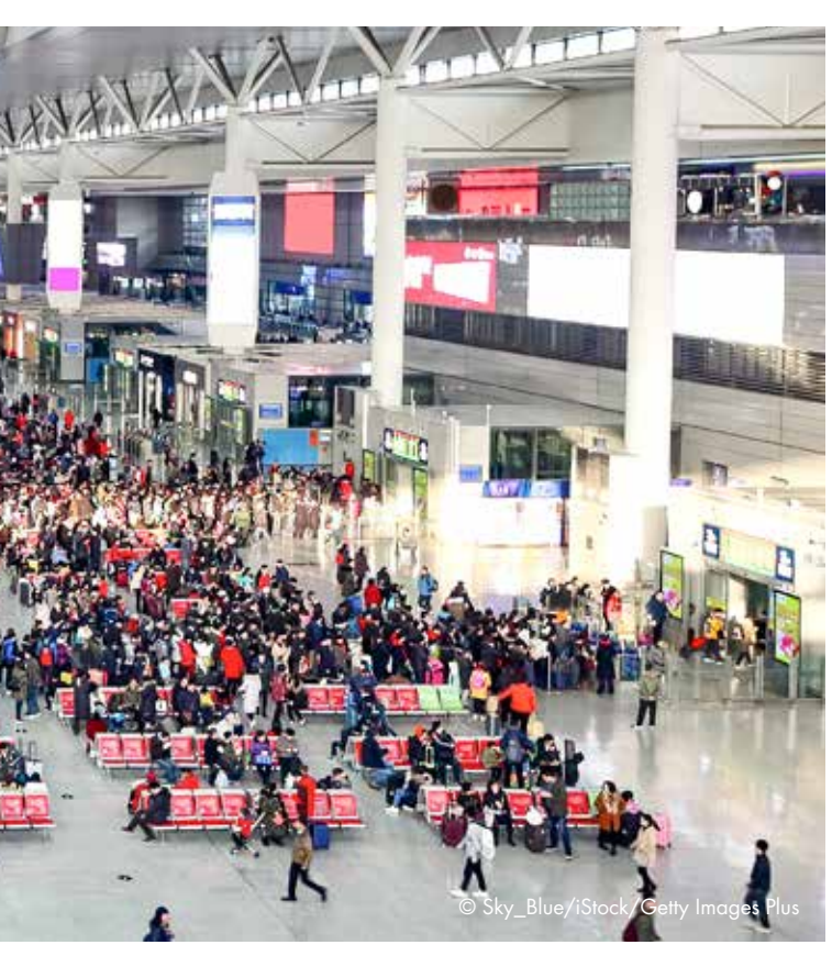
Hongqiao Railway Station. There are 30 platforms for the passengers.

already. Gradually, the production of trains in China picked up speed. Today, there are Chinese trains that achieve up to 350 kilometers per hour and top the list of the world's fastest mass-produced trains.