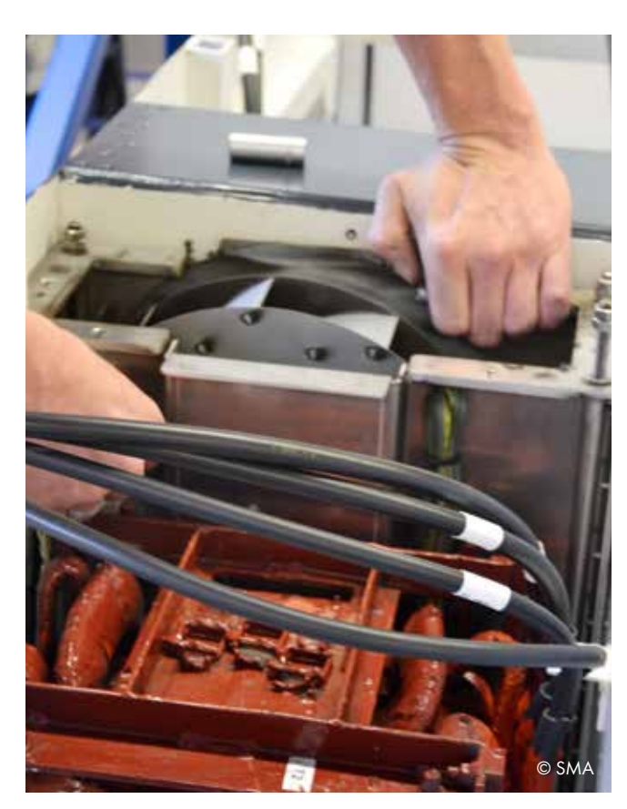
These measures ensure the high reliability of the auxiliary power converters even beyond the end of their service life as it was originally planned.

into consideration. In addition to the replacement of the container, which NedTrain had requested, the team identified which wearing parts needed to be inspected and replaced.