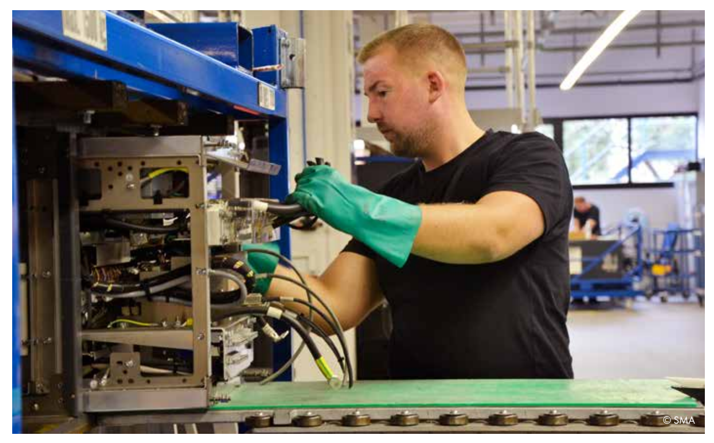
One by one, the ICM fleet of Dutch rail operator Nederlandse Spoorwegen is being modernized.

The current refurbishment project undertaken by Dutch company NedTrain has almost model character. NedTrain is the maintenance company of Nederlandse Spoorwegen, the Dutch rail operator. With a view towards maximum fleet availability and sustainability of the rolling stock, NedTrain started early to examine the reliability of the power supply systems of their fleets. Because of the excellent performance of the auxiliary power converters used in the ICM fleet, NedTrain approached SMA Railway and asked them to investigate whether the service life of their tried-and-tested systems could be extended.