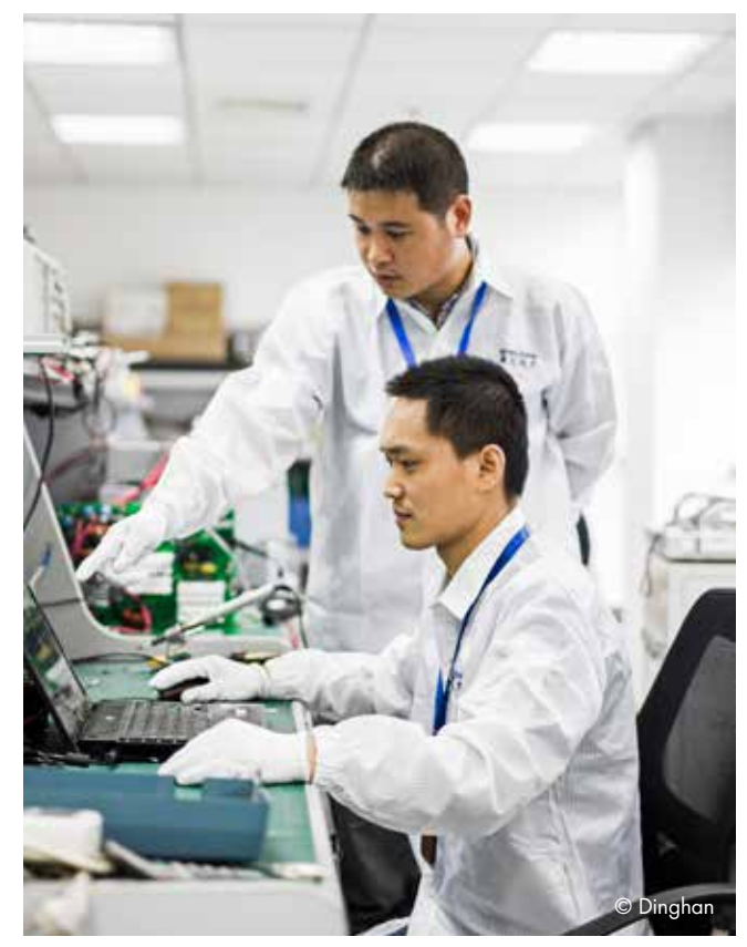
One of seven R&D facilities: Dinghan engineers working in the laboratory.

As the first European company to be acquired, SMA Railway